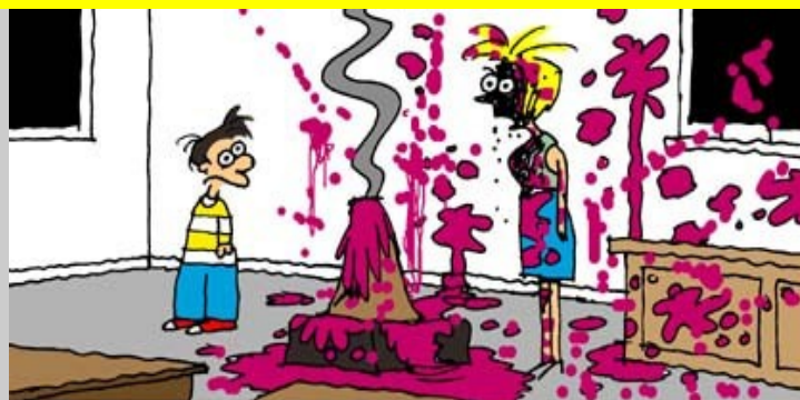
"From now on I'll no longer accept volcanoes as science projects."

Via Long Beach Pick & Shovel Taken from the Audubon Society Field Guide to North American Rocks